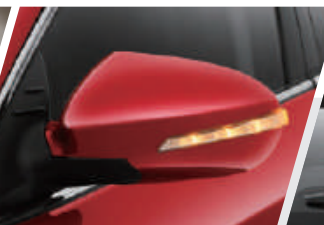
AUTO RETRACTABLE LED SIDE MIRROR