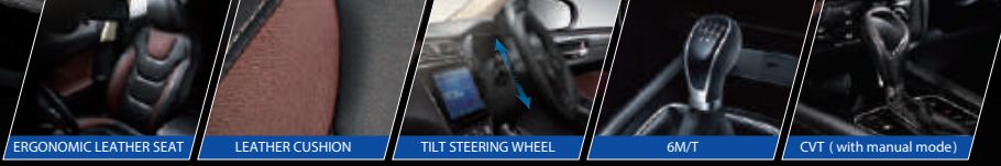
ERGONOMIC LEATHER SEAT | LEATHER CUSHION | TILT STEERING WHEEL | 6M/T | CVT ( with manual mode)