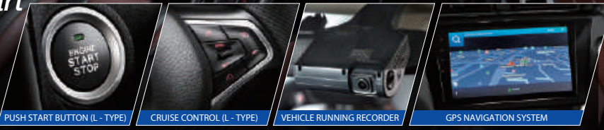
PUSH START BUTTON (L - TYPE) | CRUISE CONTROL (L - TYPE) | VEHICLE RUNNING RECORDER | GPS NAVIGATION SYSTEM