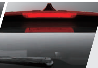
LED HIGH MOUNT STOP LAMP