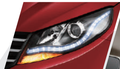
EAGLE-EYE SHAPED HEADLAMP